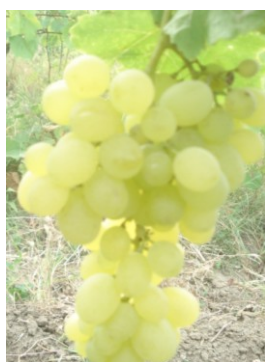
Fig.2 Auriu de Ștefănești