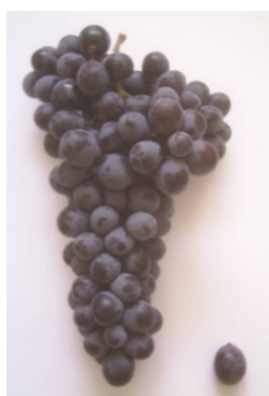
Fig.1 Muscat de Adda

The research were taken place in the Comparison Field of INCDBH Ștefanesti Arges, between 2010-2012. The system of culture in non-protected, semi stem and the grapevine are planted at the distance of 2,2 meters between the rows and 1,0 meters between the vines of a row (4545 grape vine/ha). There were studied five vines from each grape variety and noticed total buds, total dead buds, total viable buds, total copause, fertile copause, sterile copause, total inflorescences and fertile copause percentage. Also, we made a synoptic table of fertility with the fertility coefficient (relative and absolute).